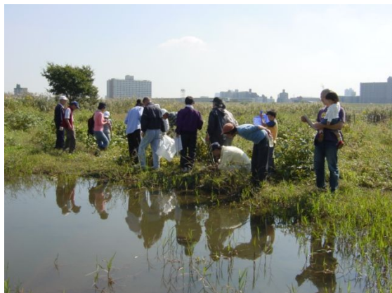
3. Nature observation around a manmade biotope on the riverbed.