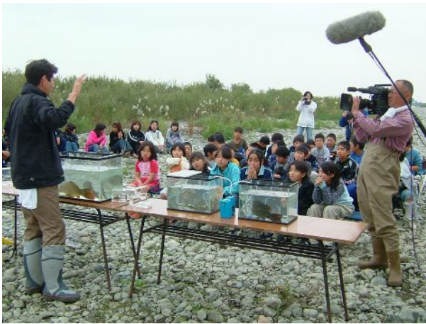
2. An open air school on the Arakawa River bed for children.