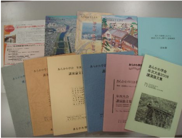
1. Books and Proceedings published by Arakawa Gakkai.