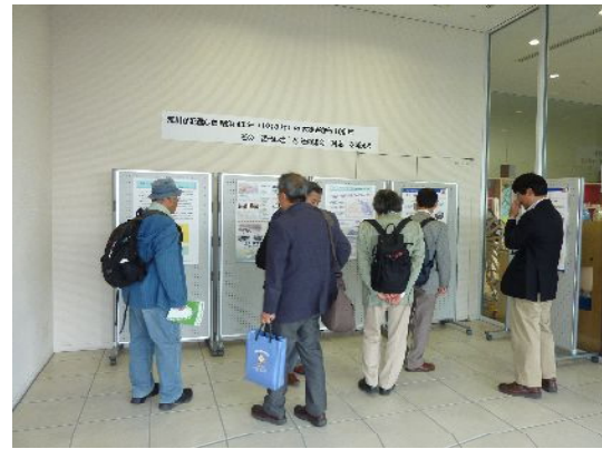
7. Symposium and panel session