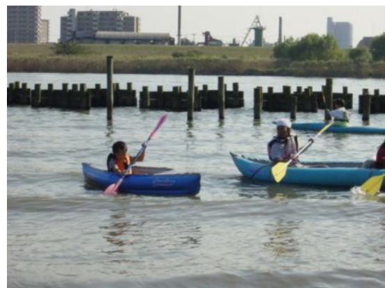
4. A canoeing school for learning safety river recreation.