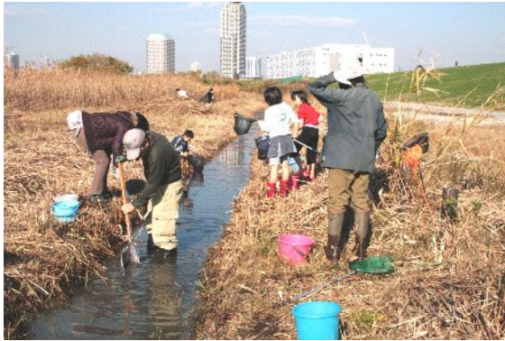
5. Investigations of life